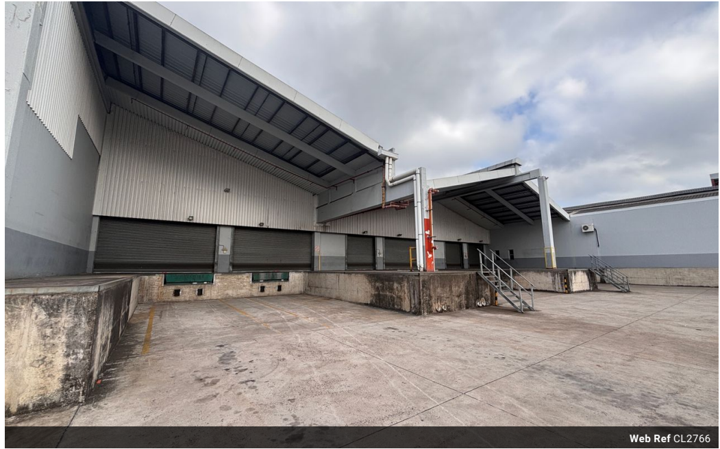
Web Ref CL2766