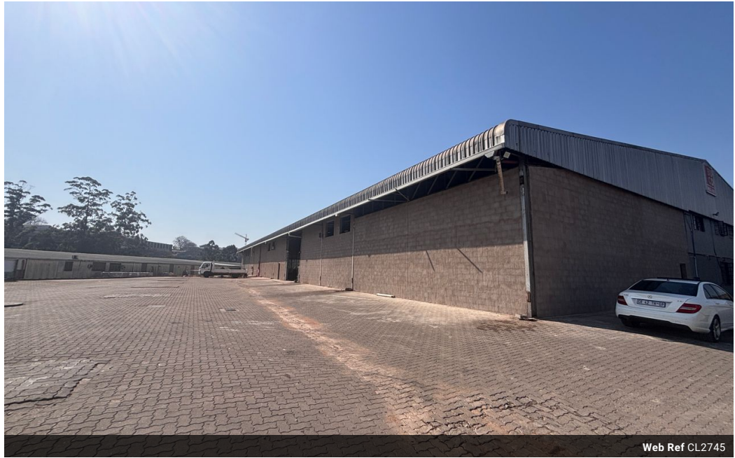
Web Ref CL2745