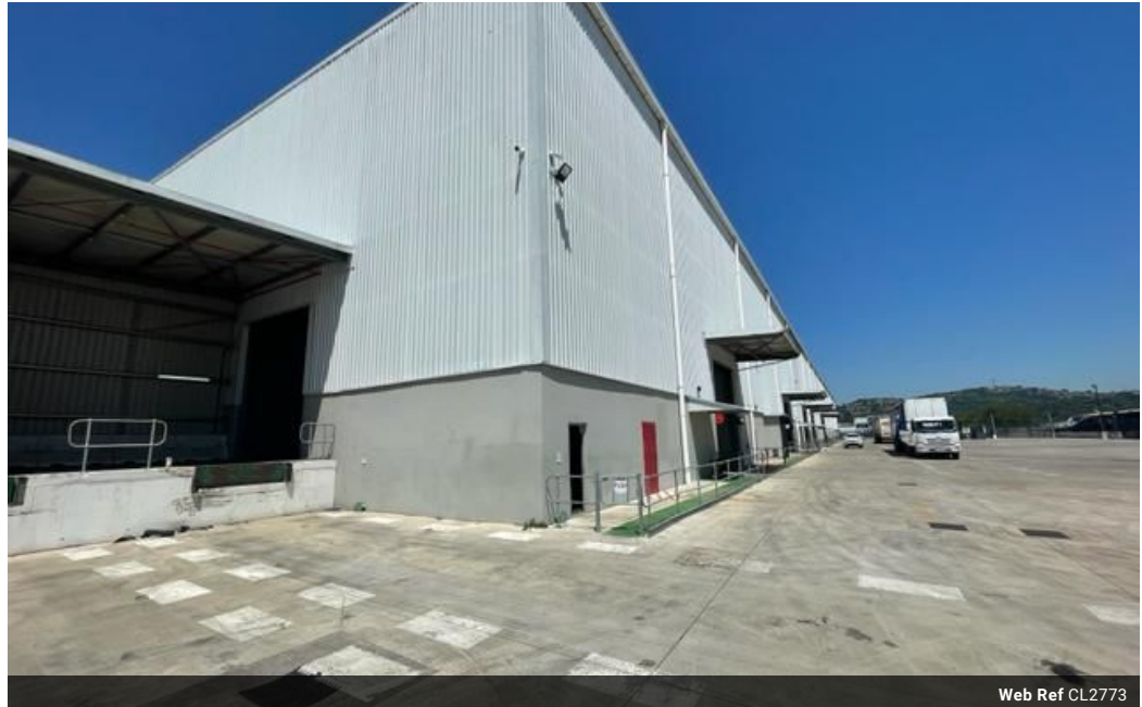
Web Ref CL2773