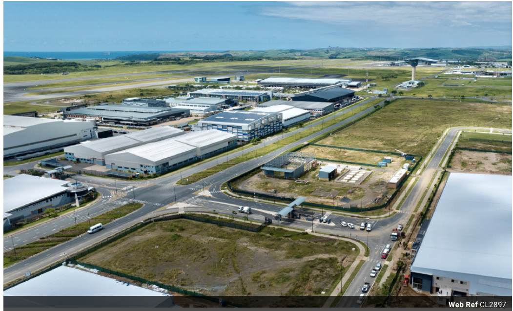
Web Ref CL2897