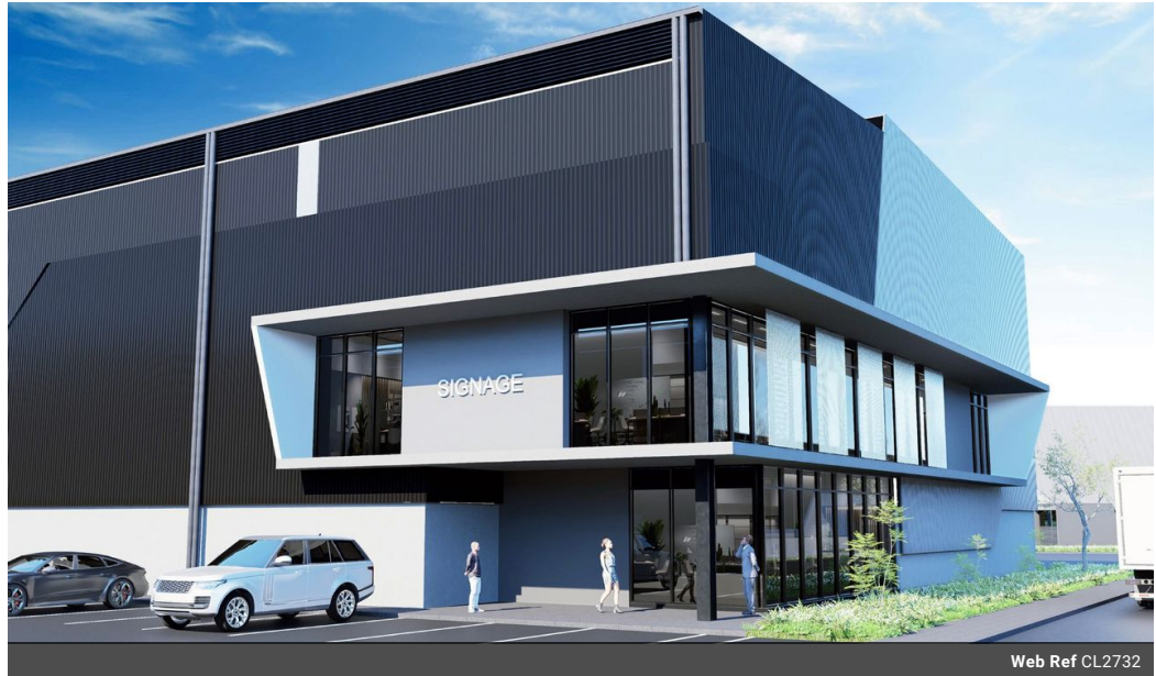
Web Ref CL2732