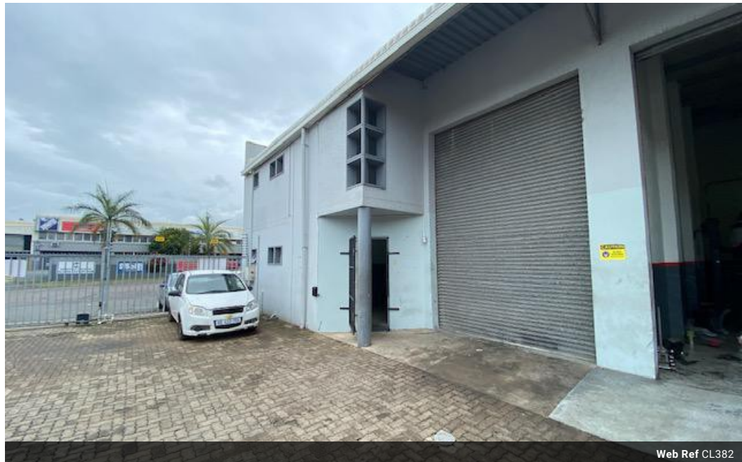
Web Ref CL382