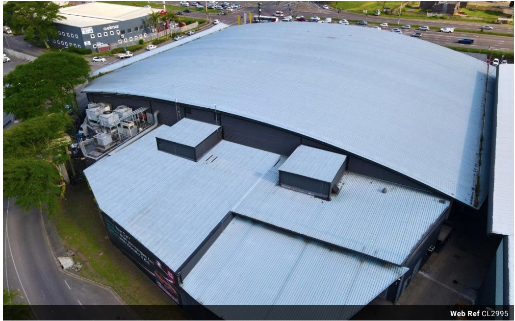
Web Ref CL2995