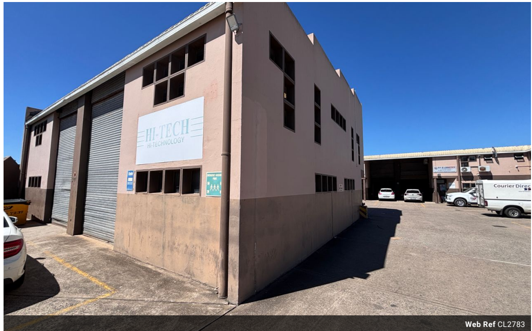
Web Ref CL2783