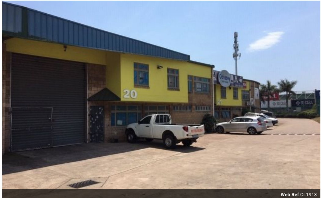
Web Ref CL1918