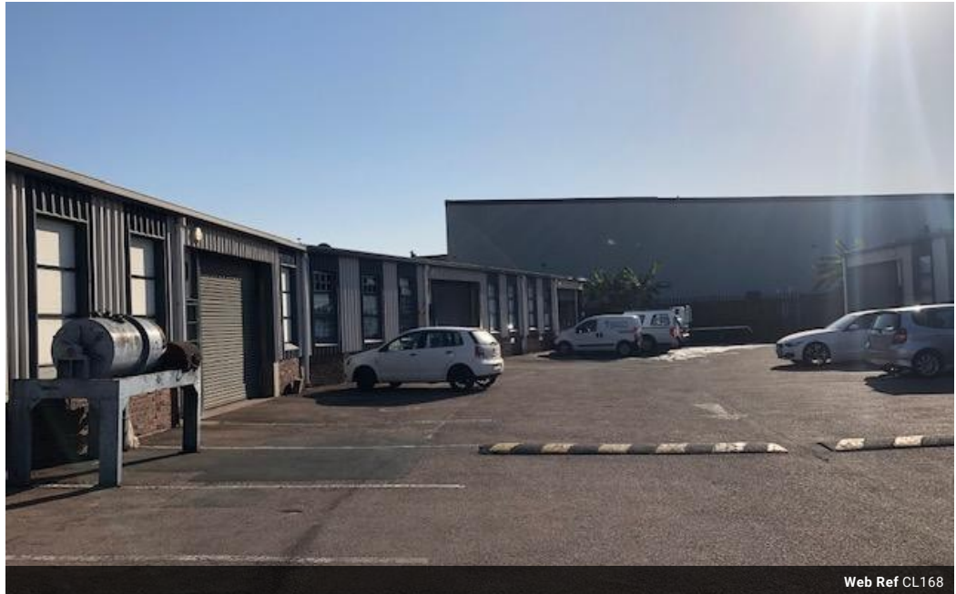
Web Ref CL168