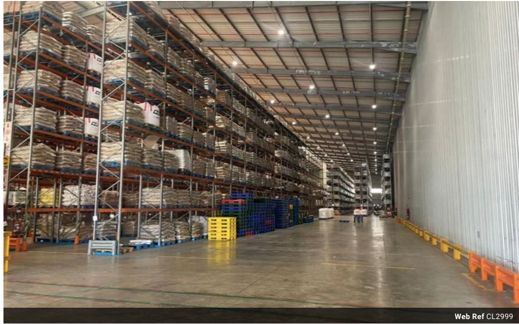
Web Ref CL2999