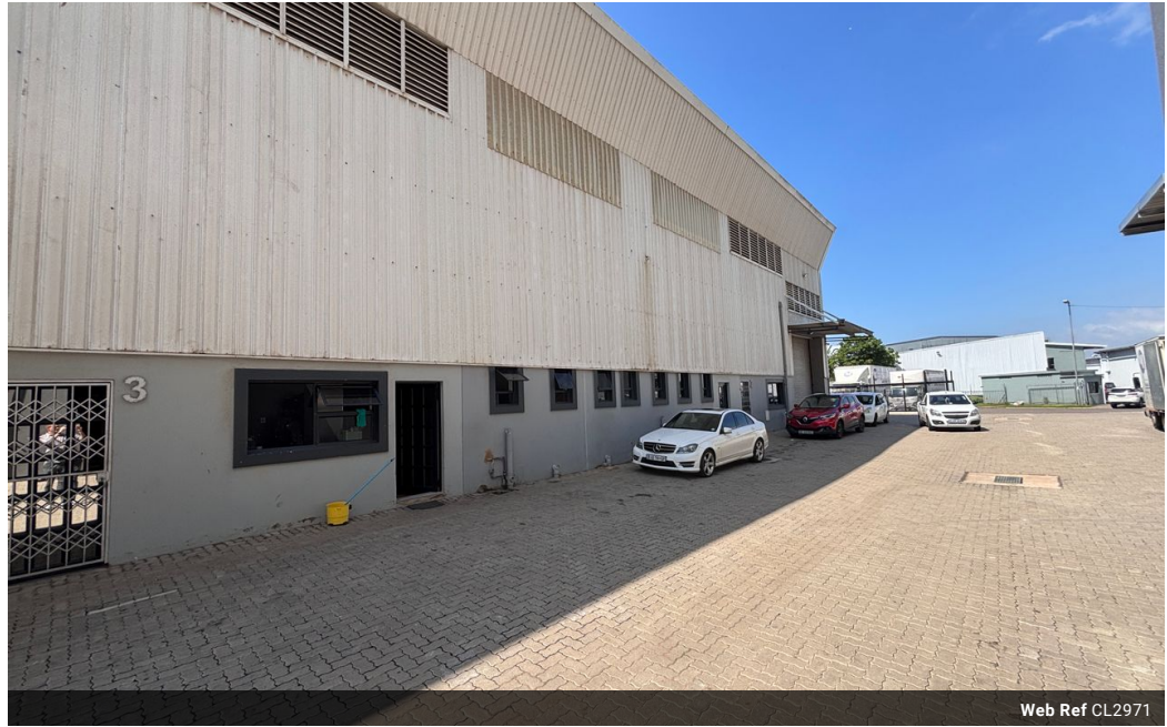
Web Ref CL2971