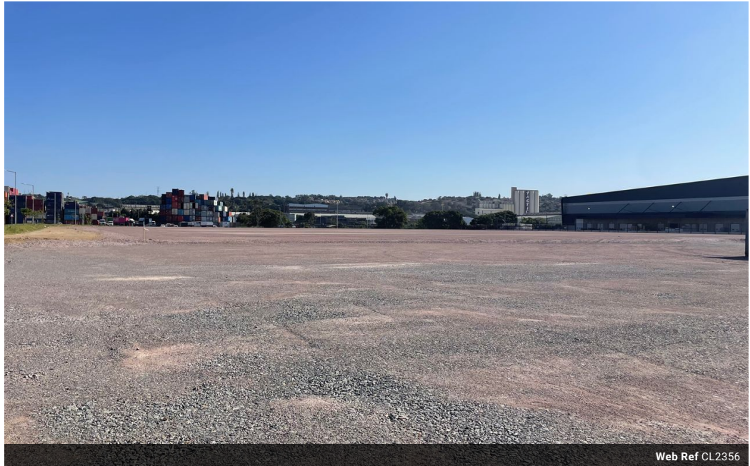
Web Ref CL2356