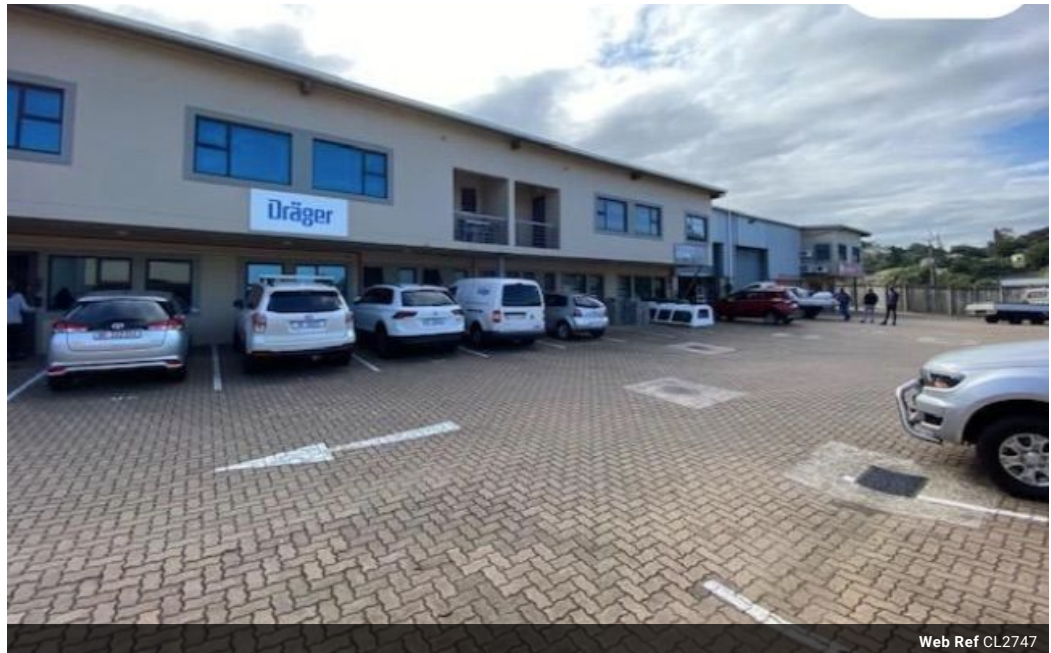
Web Ref CL2747