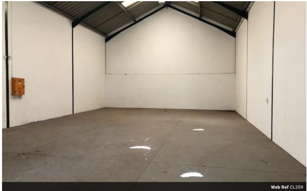
Web Ref CL359