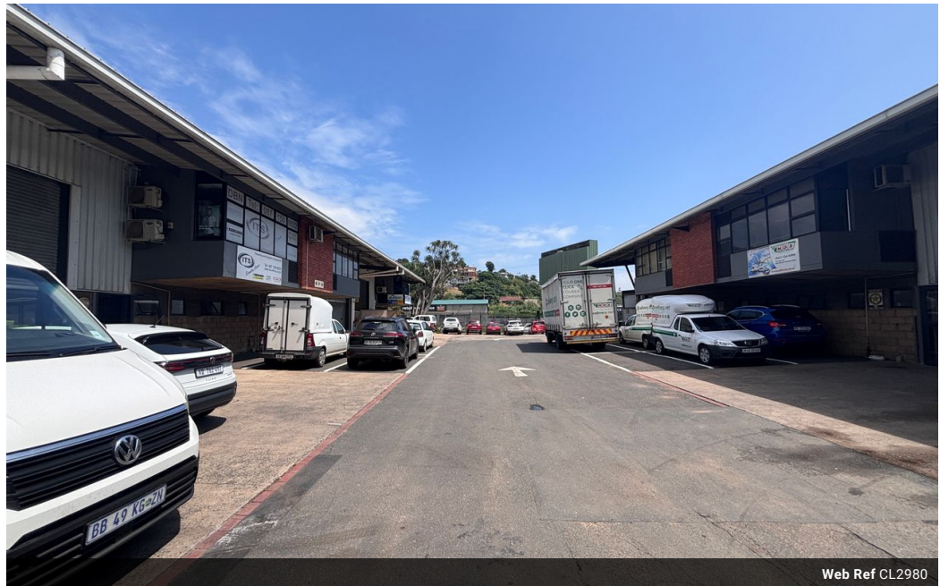
Web Ref CL2980