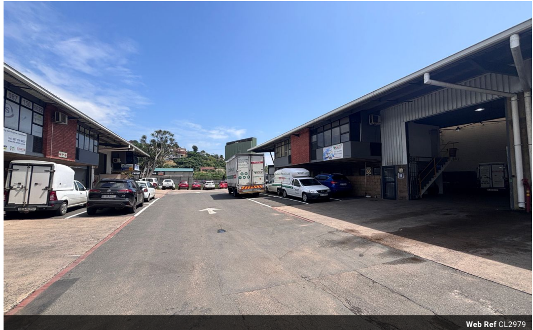
Web Ref CL2979