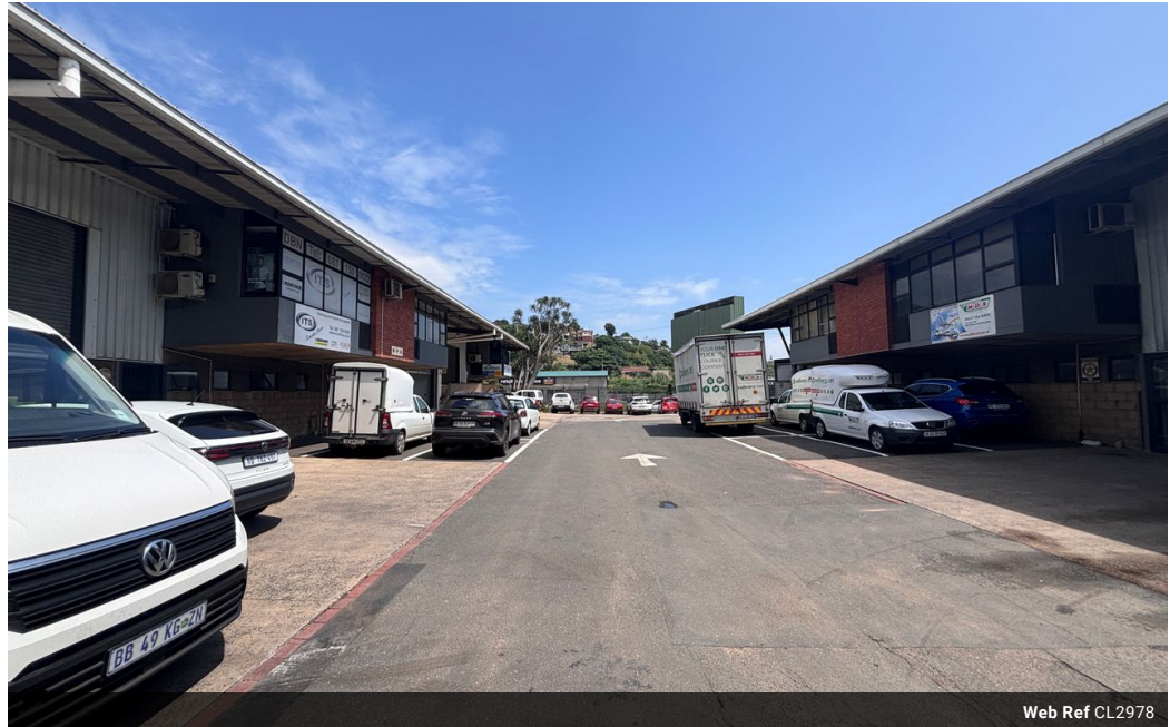
Web Ref CL2978