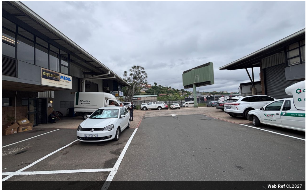
Web Ref CL2827