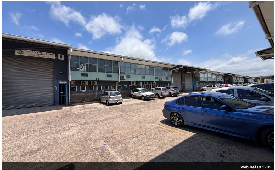
Web Ref CL2799