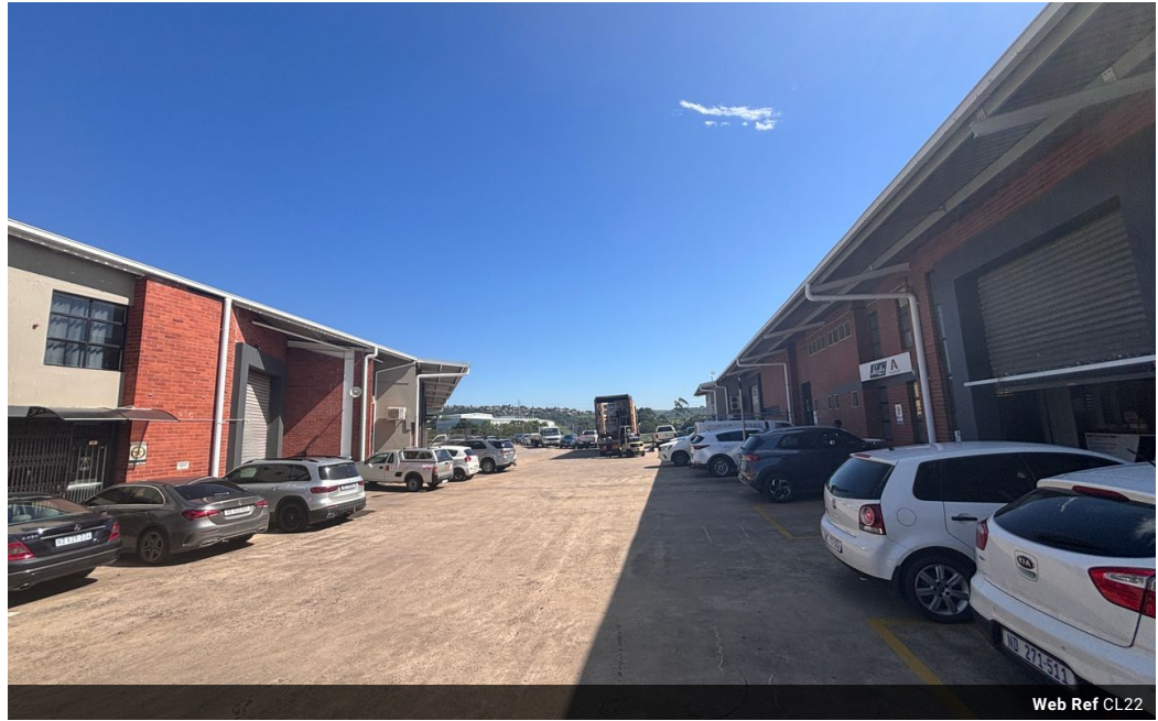
Web Ref CL22