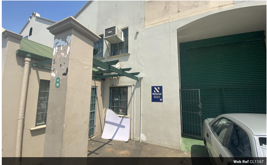
Web Ref CL1167