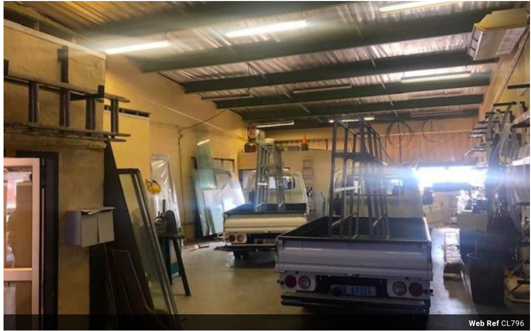
Web Ref CL796