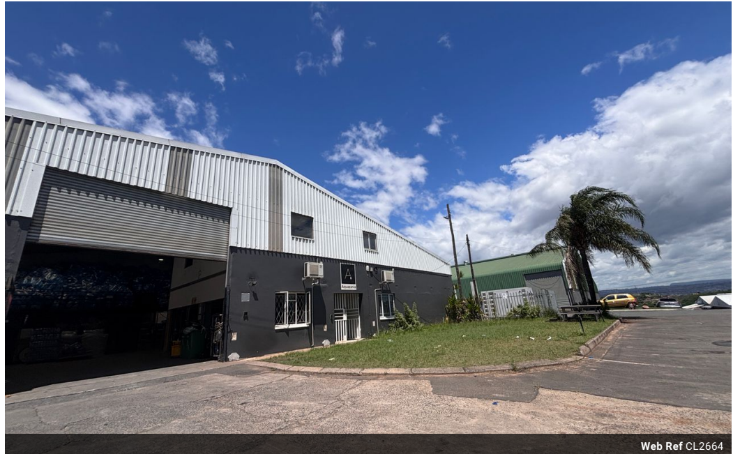
Web Ref CL2664