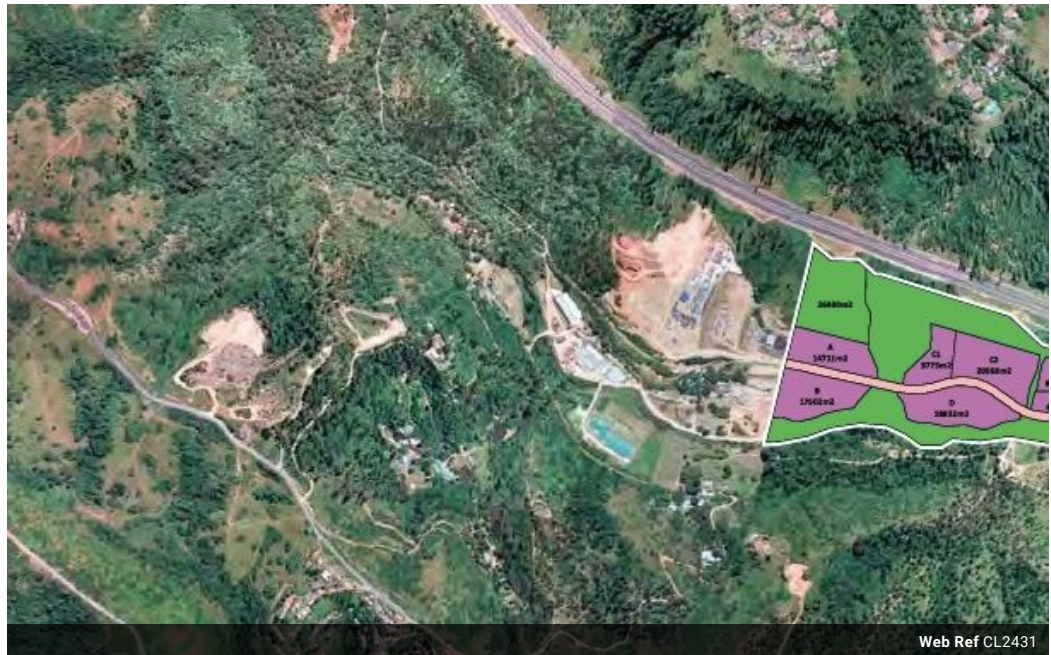
Web Ref CL2431