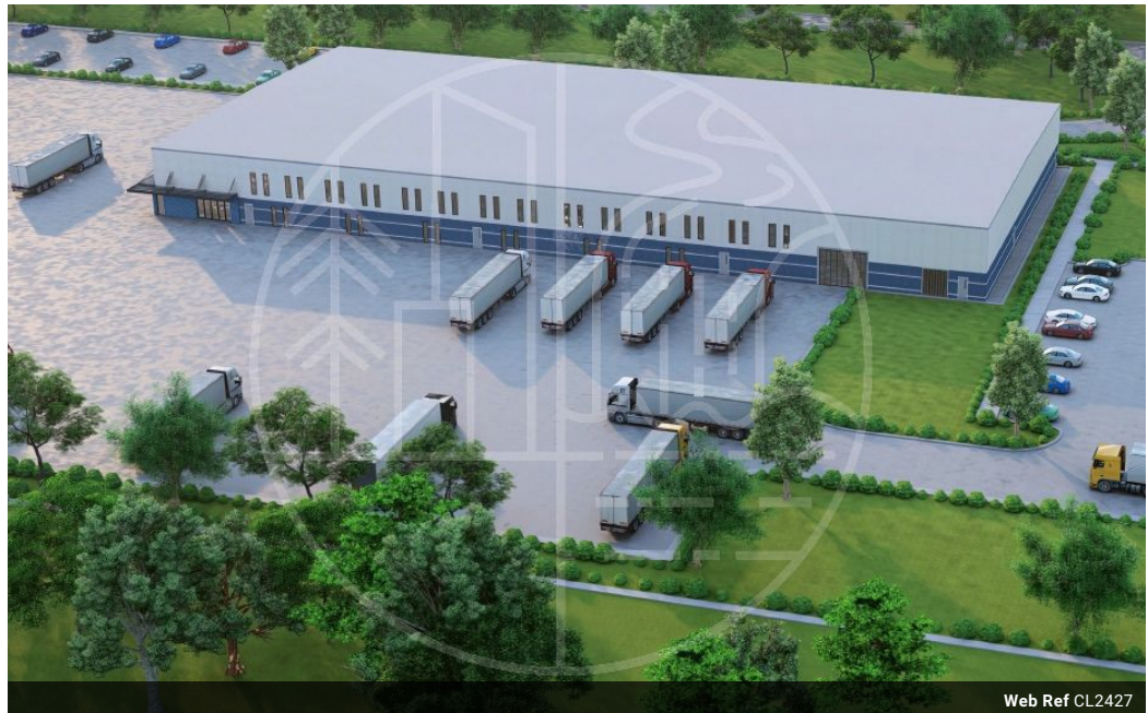
Web Ref CL2427