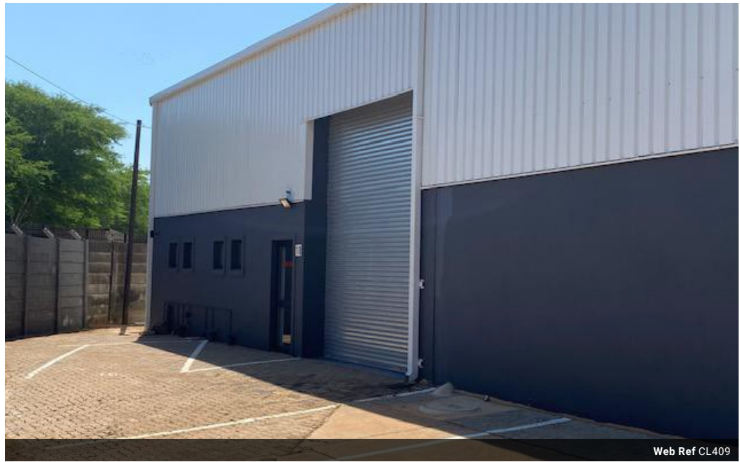
Web Ref CL409