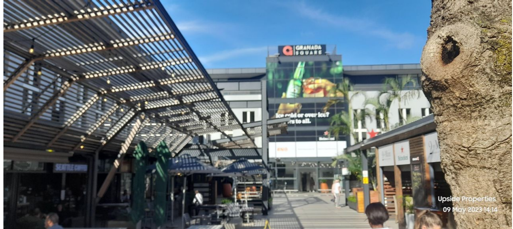
Upside Properties 09 May 2023 14:14