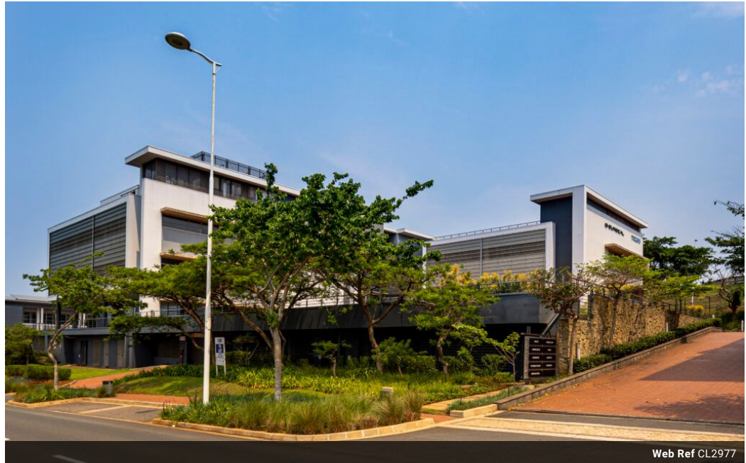
Web Ref CL2977