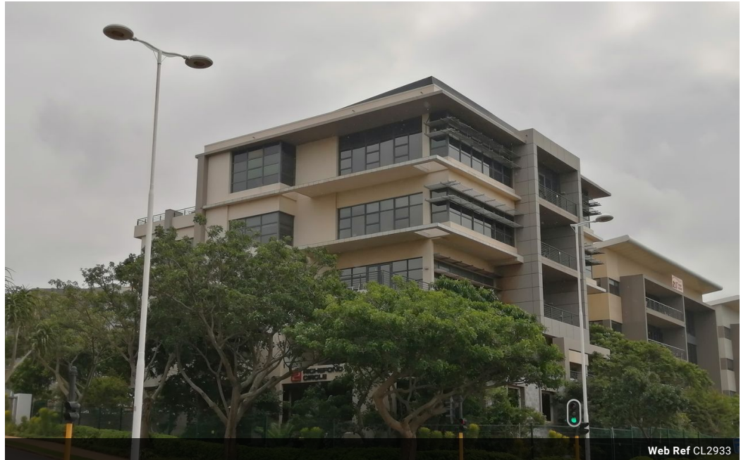
Web Ref CL2933