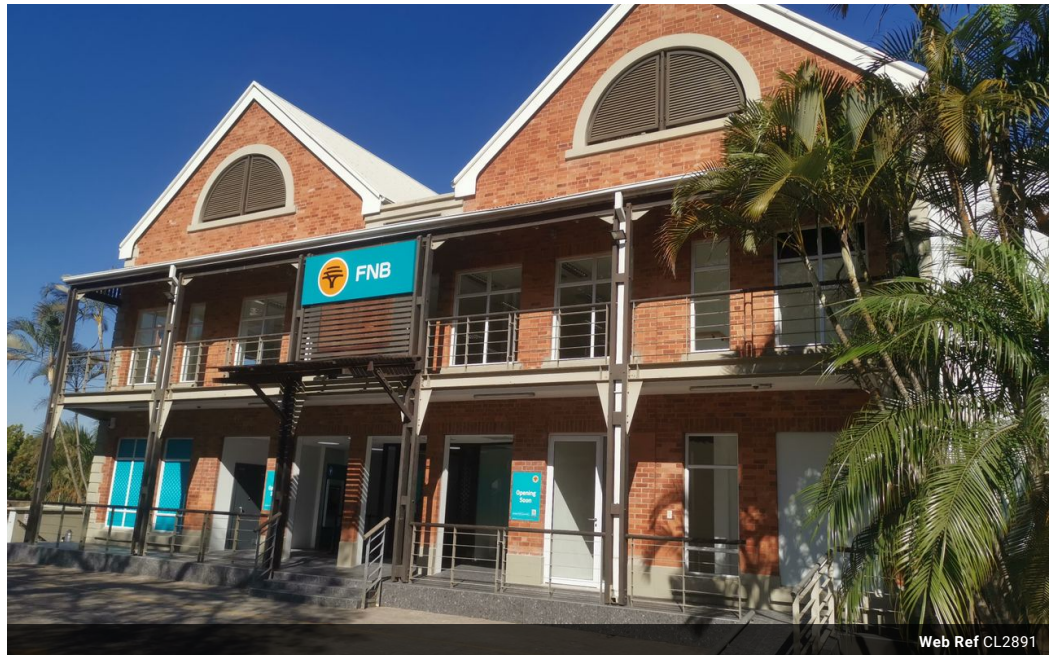
Web Ref CL2891