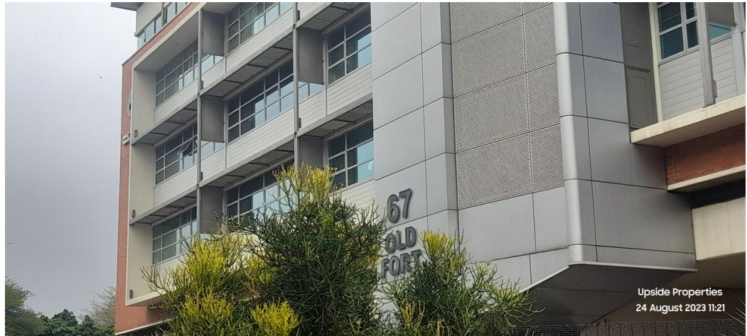
Upside Properties 24 August 2023 11:21