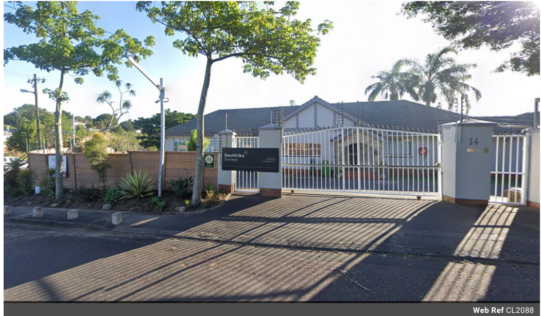
Web Ref CL2088